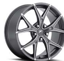
F73 GT-V CHARCOAL MACHINED 18X8 17X7.5 16X7.5