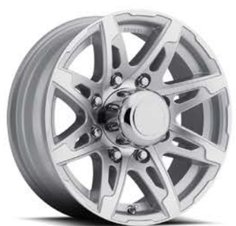
T10 2 FINISHES