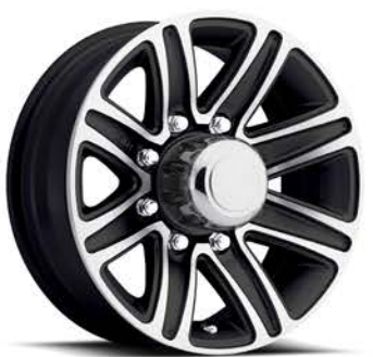
T09 2 FINISHES