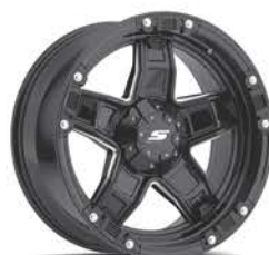
S31 MIA GLOSS BLACK MILLED 22X9.5 20X9 18X9 17X9