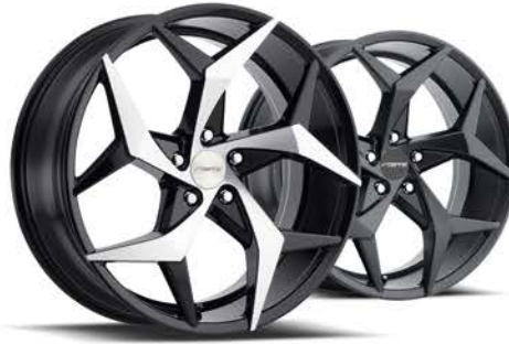
F78 SHURIKEN BLACK MACHINED | MATTE BLACK 20X8.5 18X8 17X7.5