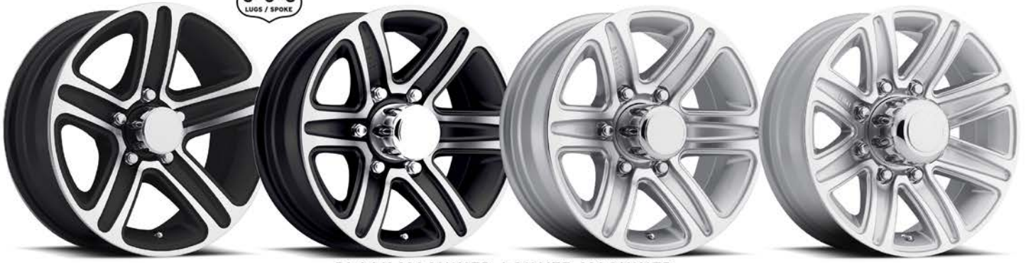
BLACK MACHINED / SILVER MACHINED

5 LUG 5 SPOKE 6 LUG 6 SPOKE 8 LUG 8 SPOKE