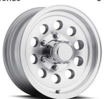
S20 2 FINISHES