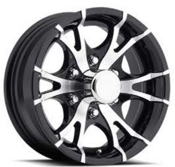
T07 5 FINISHES