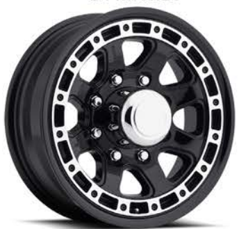
T11 2 FINISHES