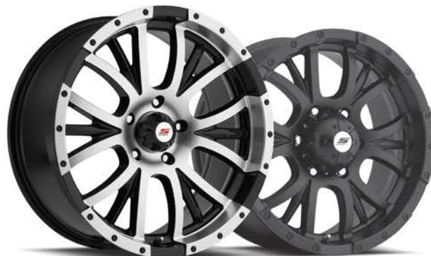
S13 GLOSS BACK MACHINED | MATTE BLACK 17X8 16X8 15X8 15X7