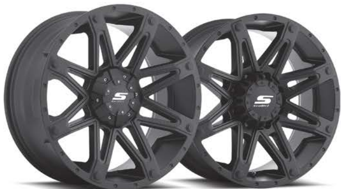
S35 RECON / RECON-8 MATTE BLACK RECON 20X9 18X9 17X9 RECON-8 20X9 18X9