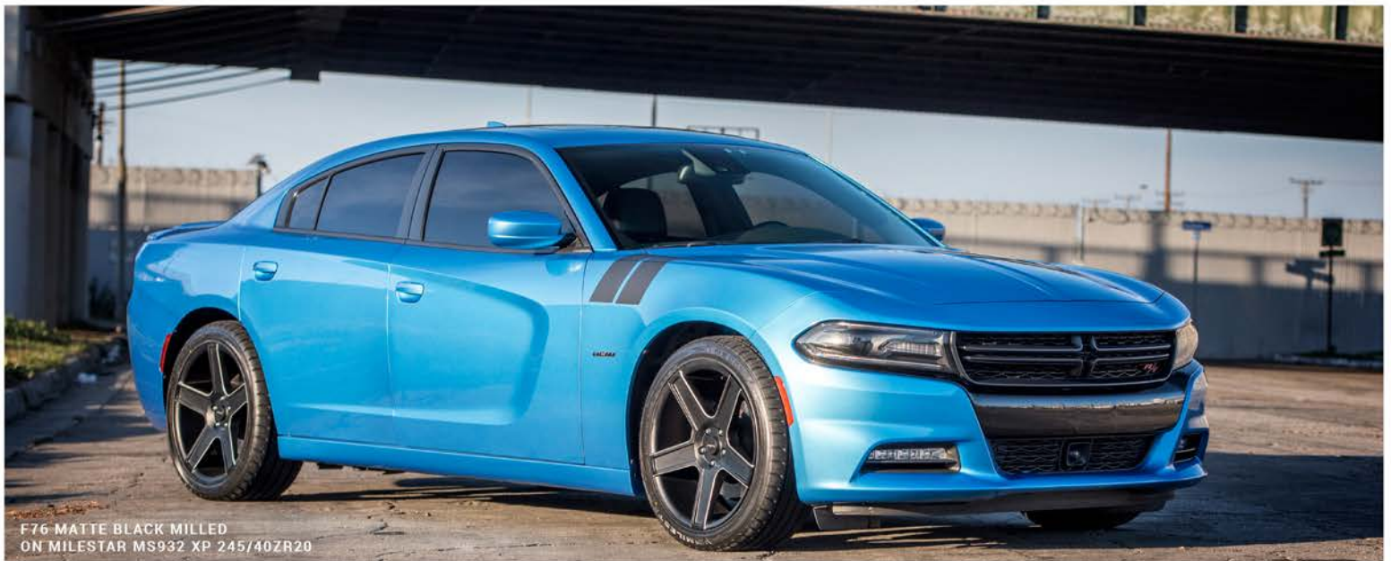
F76 MATTE BLACK MILLED ON MILESTAR MS932 XP 245/40ZR20