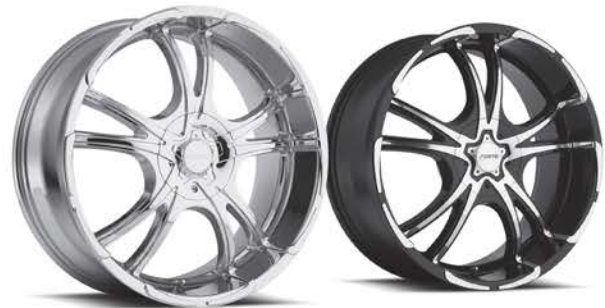
F50 *STRESS / TWISTED CHROME | BLACK MIRROR 24X9.5 22X9.5 *20X8.5 *18X8