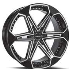
F63 JONES SIX BLACK MIRROR 22X10 20X9