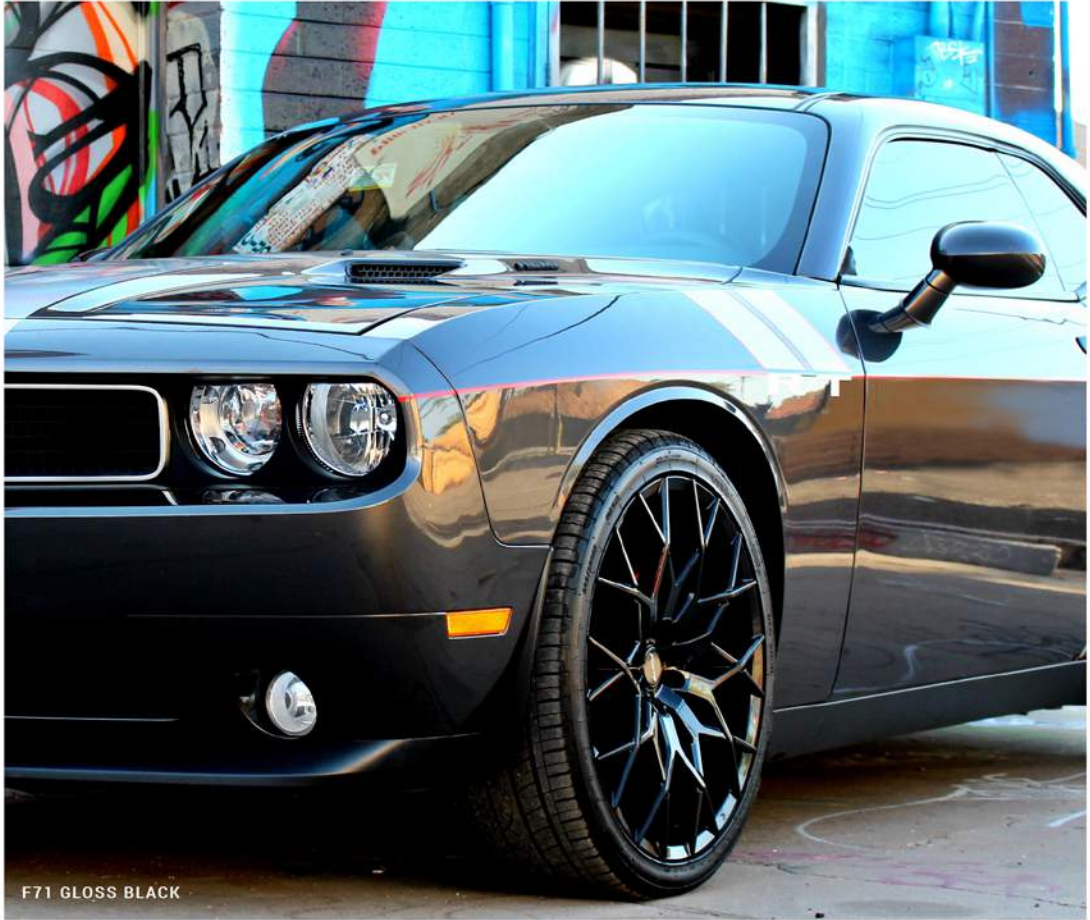
F71 GLOSS BLACK