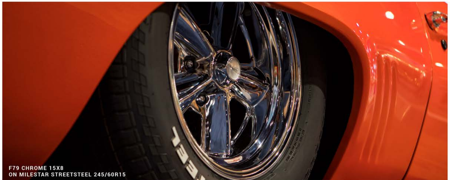
F79 CHROME 15X8 ON MILESTAR STREETSTEEL 245/60R15