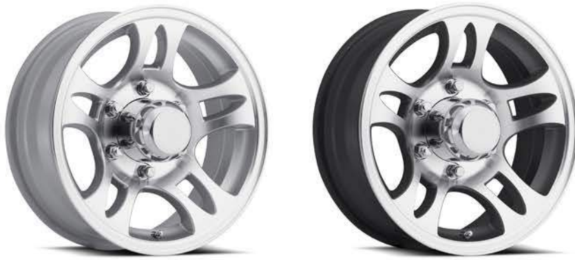
SILVER MACHINED / BLACK MACHINED