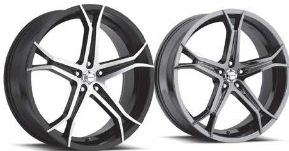
F70 *JEKYLL / HYDE *BLACK MIRROR | DARK PVD 22X8.5 20X8.5 18X8 17X7.5 16X7