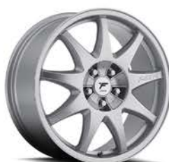
F74 TETON SILVER 18X8 17X7 16X7