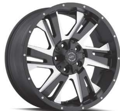
S36 NIGHT HAWK MATTE BLACK MILLED 20X9 18X9 17X9