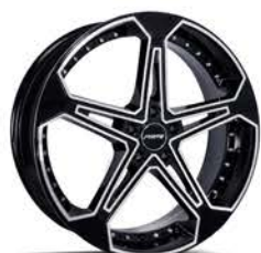
F62 JONES FIVE BLACK MIRROR 22X10 22X8.5 20X8.5