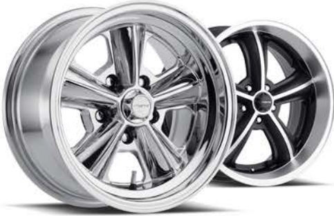
F79 WOODWARD CHROME | MATTE BLACK MACHINED SILVER MACHINED (NOT PICTURED) 20X10 20X8.5 15X8 15X7