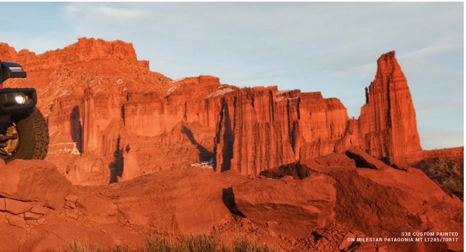
S38 CUSTOM PAINTED ON MILESTAR PATAGONIA MT LT285/70R17