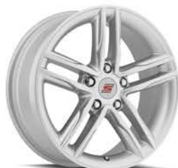
S30 SILVER 17X7 16X7