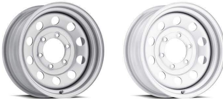
SILVER / WHITE* AVAILABLE 5.20.2018