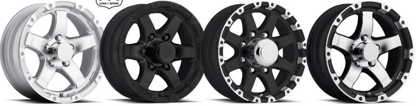
SM (NOT PICTURED) / SMLS / MB / MBML / BMLS

5 LUG 5 SPOKE 6 LUG 6 SPOKE 8 LUG 8 SPOKE