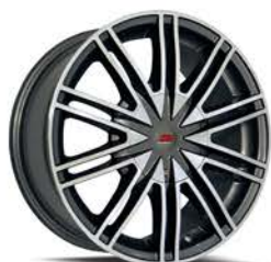
S07 CHARCOAL MACHINED 17X7.5 16X7 15X7