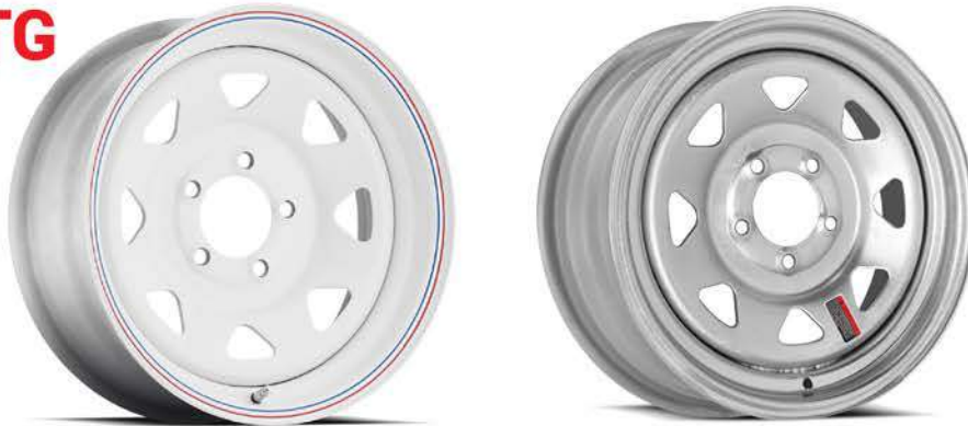
WHITE / GALVANIZED