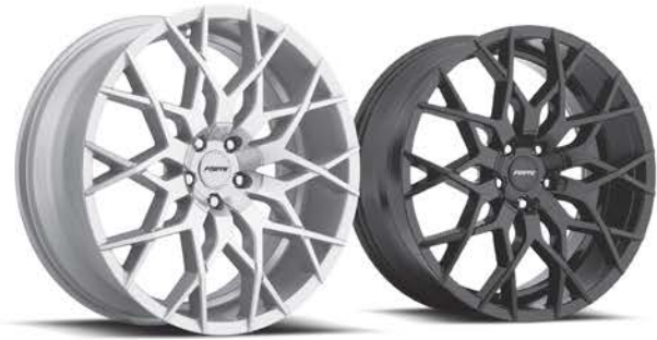
F71 MISTRESS SILVER MACHINED | GLOSS BLACK 22X9 20X8.5 18X8