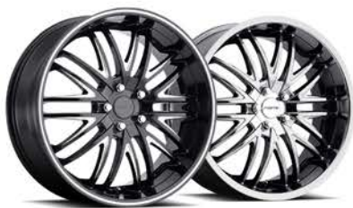
F75 EURO / IDOL GLOSS BLACK MILLED | BRIGHT PVD 22X9 20X8.5 18X8