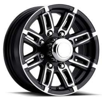
T06 3 FINISHES