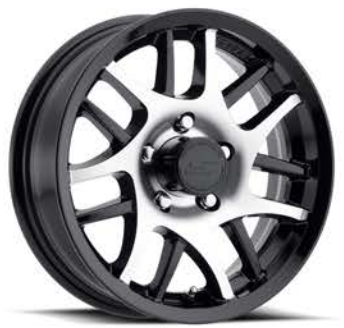
T15 2 FINISHES