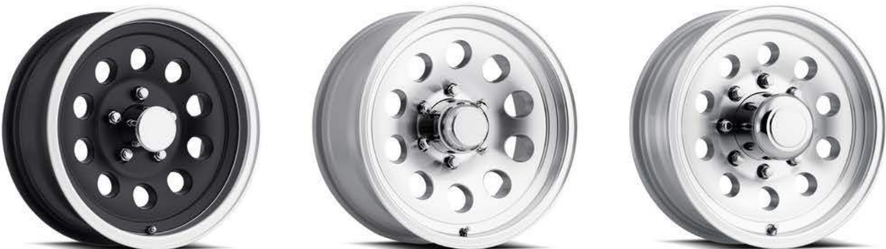
MATTE BLACK MACHINED LIP / MACHINED