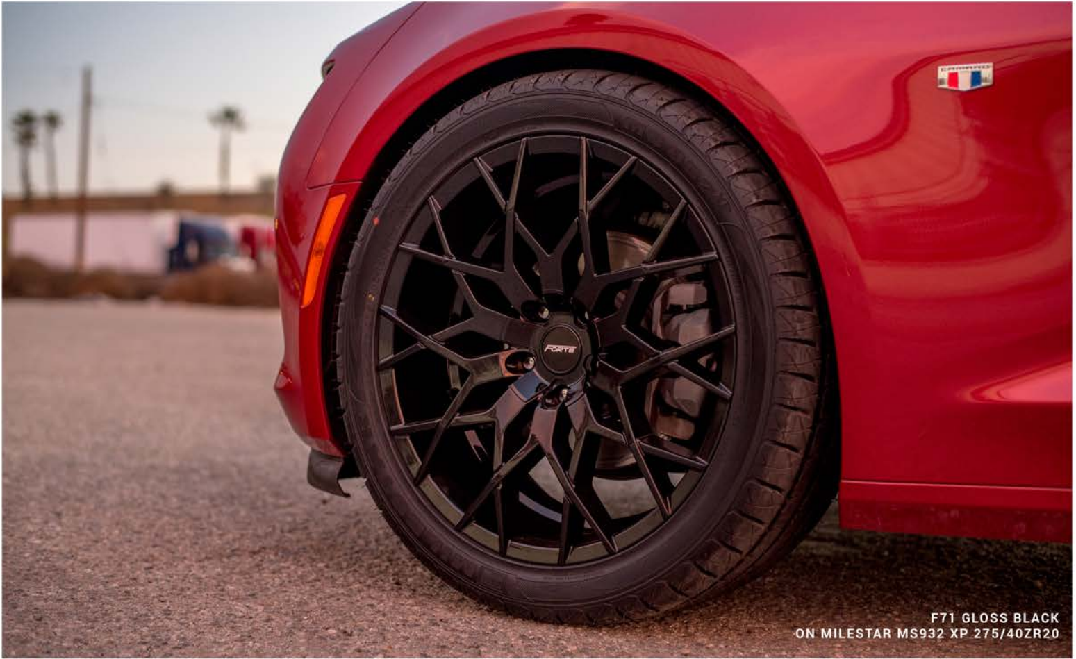
F71 GLOSS BLACK ON MILESTAR MS932 XP 275/40ZR20