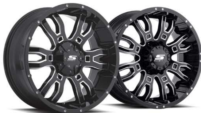
S34 SNIPER / SNIPER-8 GLOSS BLACK MILLED SNIPER 20X9 18X9 17X9 SNIPER-8 20X9 18X9