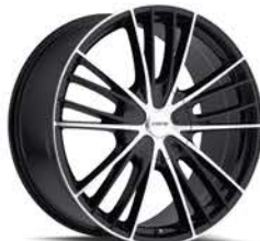
F67 NIGHT MOVES BLACK MIRROR 22X10 22X8.5 20X8.5 18X8 17X7.5