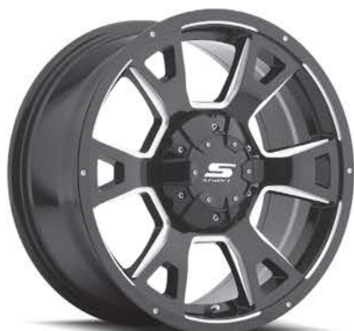
S32 SPOTTER GLOSS BLACK MILLED 17X8 16X8 15X8