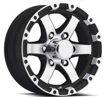
T08 5 FINISHES