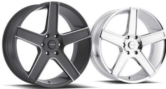
F76 JESSE-ONE MATTE BLACK MILLED | CHROME 20X9 22X9