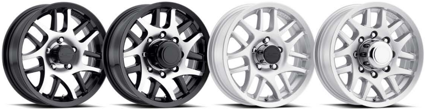
BLACK MACHINED / SILVER