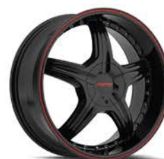
F45 REDRUM BLACK RED STRIPE 20X8.5 18X8 17X7.5