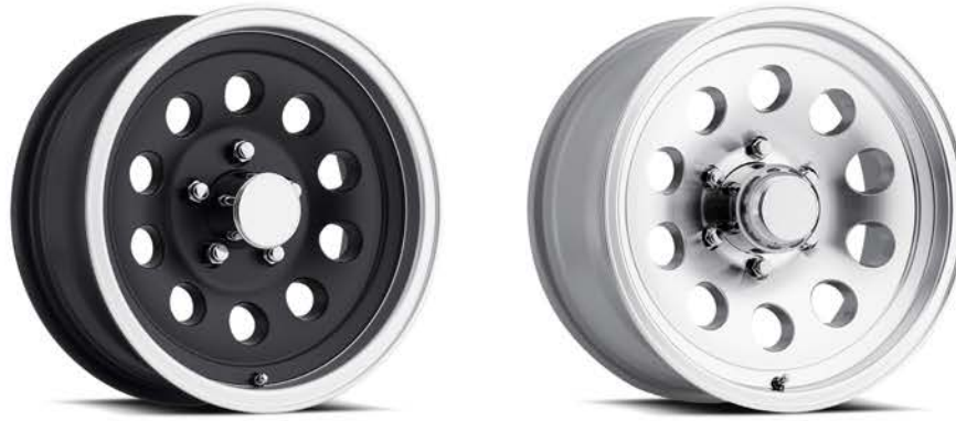
MATTE BLACK MACHINED LIP / MACHINED