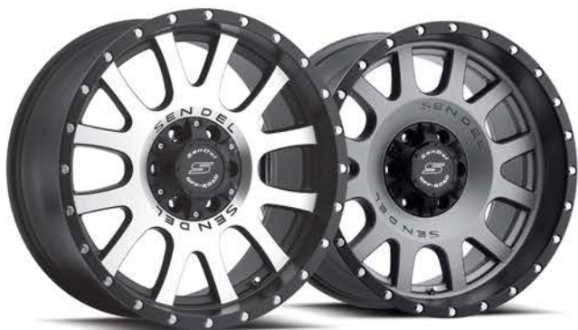
S38 LOCKER MATTE BLACK MACHINED | MATTE GRAPHITE 20X10 20X9 18X9 17X9 16X8