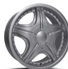
S06 SILVER 18X7.5 17X7 16X7 15X7