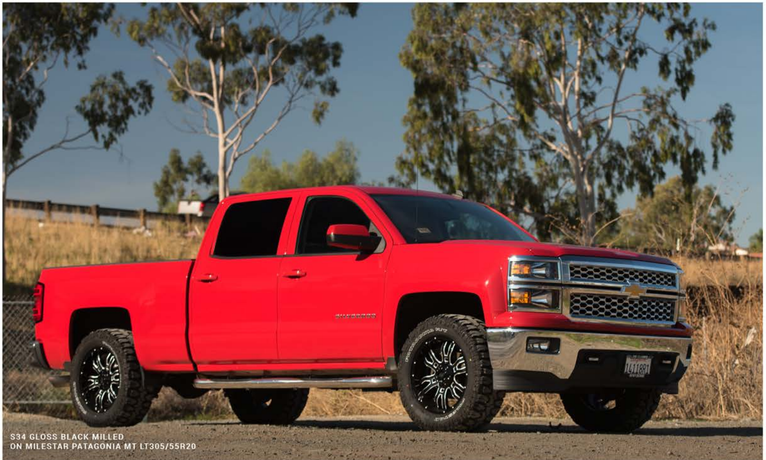
S34 GLOSS BLACK MILLED ON MILESTAR PATAGONIA MT LT305/55R20