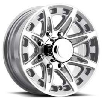
T12 2 FINISHES