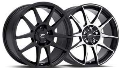
F72 BLACKOUT GLOSS BLACK | GLOSS BLACK MACHINED 18X8 17X7.5 16X7.5