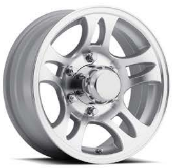
T03 2 FINISHES