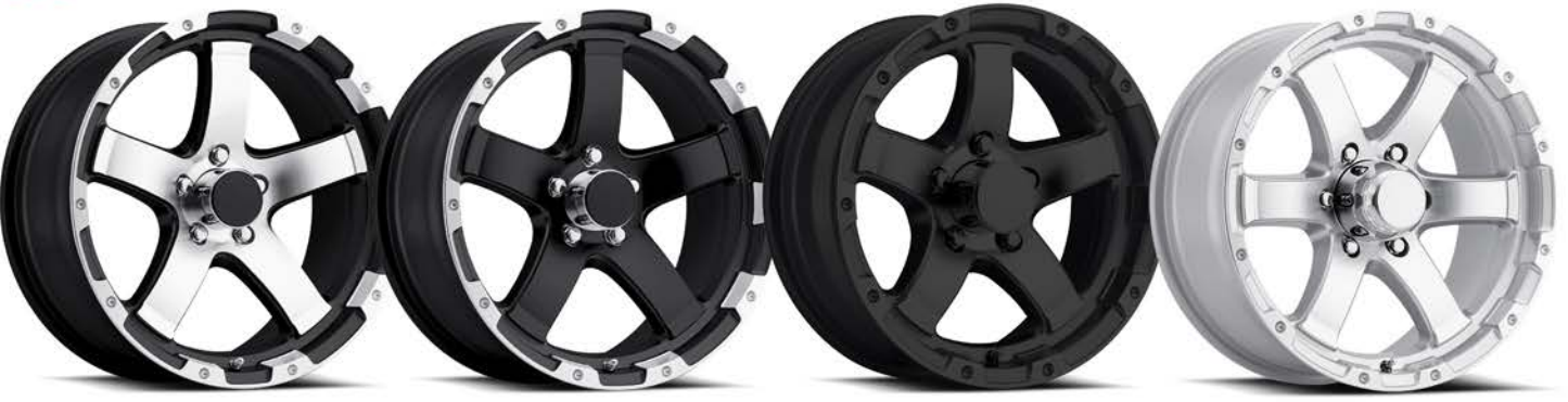
BMLS / MBML / MB / SMLS