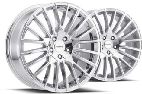
F77 BOARDWALK CHROME | SILVER MACHINED 19X8 18X8 17X7.5 16X7.5