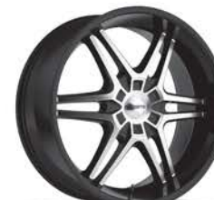
F64 CAHOOTS BLACK MIRROR 22X9.5 20X8.5