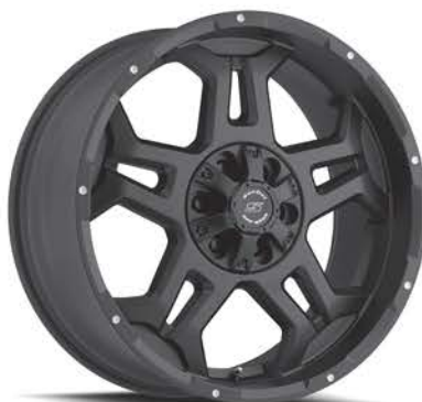
S37 STEALTH MATTE BLACK W/ MILL SPOTS 20X9 18X9 17X9